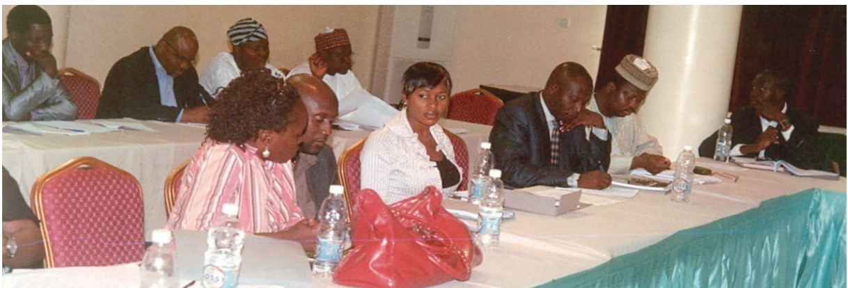
A cross section of participants at the Forum