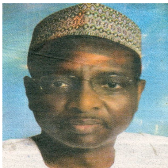
Mansur Mukhtar - Minister of Finance

GDP to -3.28% of GDP. Also the target of 2011 spending being -3.10% of GDP is worrying. These are not signs of fiscal progress. Compare the foregoing with the provisions of sections 12 (1) and (2) of the FRA: