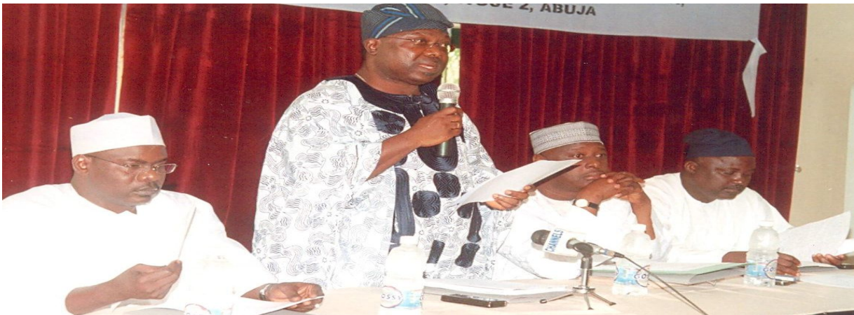
Senator Iyiola Omisore delivering a keynote address at the Forum