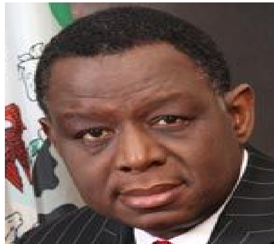
Professor Babatunde Osotimehin- Minister of Health

To promote means enacting such laws and activities as will advance, further and contribute to the enlargement and growth of the FODPSP. To enforce means to execute, make effective and compel obedience to the Fundamental Objectives and Directive Principles 3 . Essentially, by the force of the FRA, the provisions in the economic objectives of the Constitution have derived some measure of enforceability.