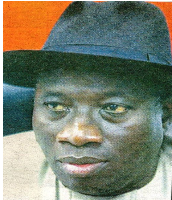
Goodluck Jonathan - Vice President

The Legislature should insist that the executive sanctions accounting officers and Ministers who have consistently failed, refused and neglected to implement the capital budgets of previous years. Administrative and other sanctions are available and the PPA's provisions should be activated.