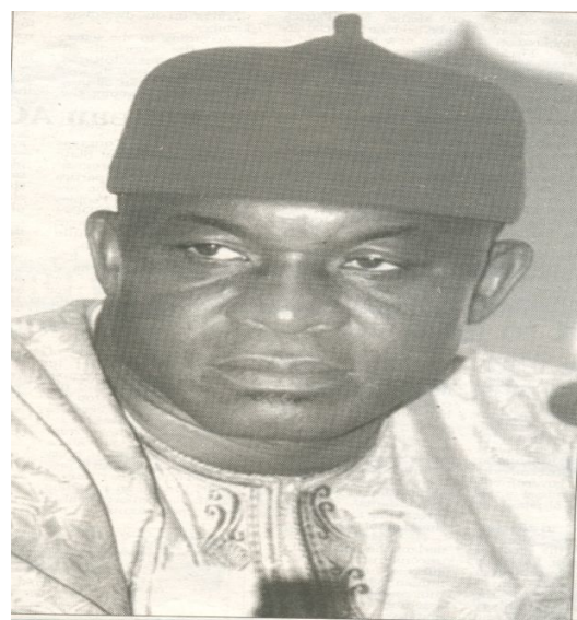
David Mark-President of the Senate

trillion is to be disbursed as follows: Statutory Transfers (180.28 billion); MDAs Recurrent Non-Debt Expenditure (1,361.7 billion); Capital Expenditure (1,370.82 billion); Debt Service (517.1 billion); and Consolidated Revenue Fund Charges (649.8 billion) respectively. In overall terms, the proposed bill represents a 31.5% increase over the 2009 estimates.