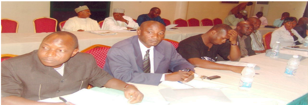
Another cross section of participants at the Forum